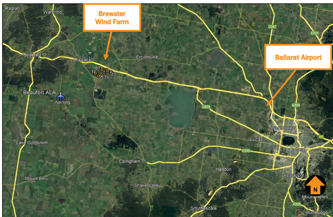
Figure 1 Project site location overview

An overview of the Project site relative to Ballarat and Beaufort in Victoria is provided in Figure 1.