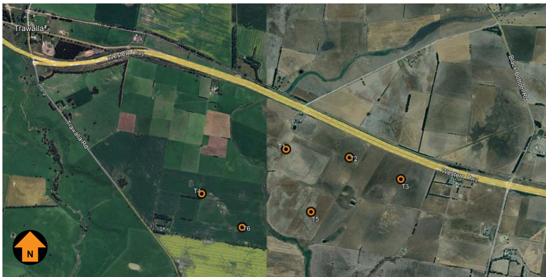
Figure 2 Brewster Wind farm layout